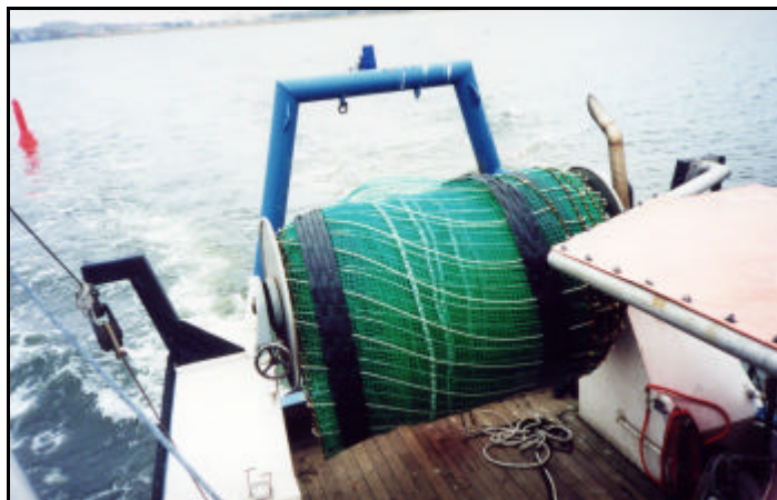
Figure 5: Conventional seagoing vessel with equipment for lowering and pulling in the special net (prototype)