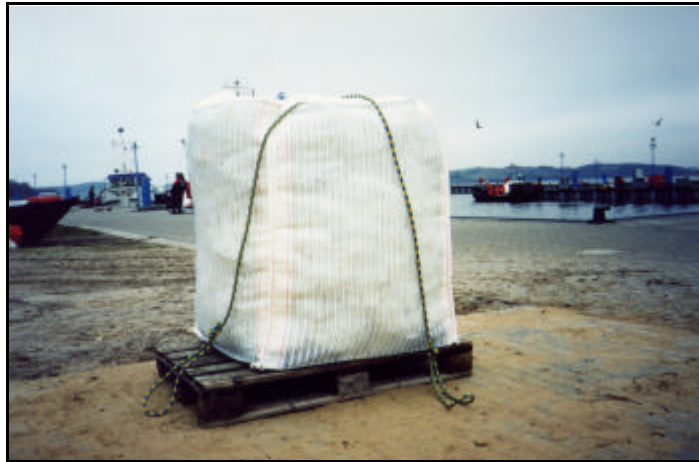
Figure 3: Container (prototype) for storage and placement

Collection of the oil-filled adsorbents floating on deeper water is carried out by specially constructed enclosing nets (Figure 4). The arch-shaped upper edge of the net reaches above the surface of the water. Pulling the net by two ships at a distance of about 150 to 200 m a wedge is formed for collection of adsorbents. Conventional seagoing vessels fitted for lowering and pulling in the special net can be used (Figure 5). After hauling in the net, the adsorbents are picked up by special equipment to avoid losses of the adsorbed oil.