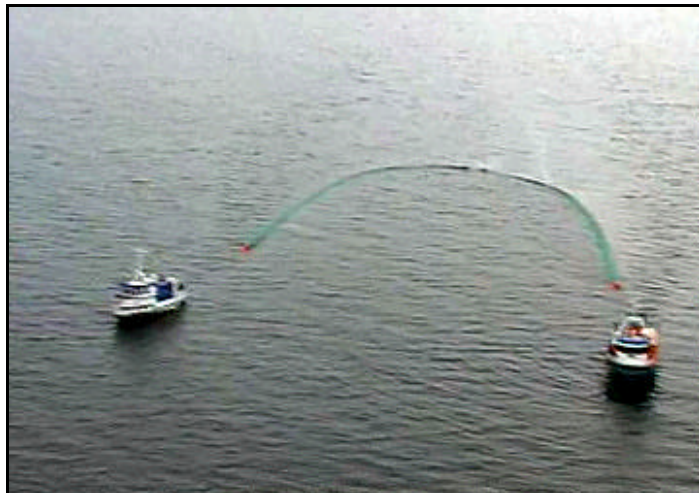
Figure 4: Field test with a prototype of a surface controlled net

Collection of the oil-filled adsorbents floating on deeper water is carried out by specially constructed enclosing nets (Figure 4). The arch-shaped upper edge of the net reaches above the surface of the water. Pulling the net by two ships at a distance of about 150 to 200 m a wedge is formed for collection of adsorbents. Conventional seagoing vessels fitted for lowering and pulling in the special net can be used (Figure 5). After hauling in the net, the adsorbents are picked up by special equipment to avoid losses of the adsorbed oil.