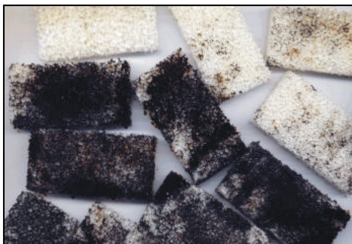
Figure 2: Oil adsorbents (prototypes) partly filled with extremely viscous oil (IFO 380)

After placement the containers sink into the water and open automatically. The released adsorbents rise to the water surface and the oleophilic elements adsorb the oil in the water column on their way to the water surface.