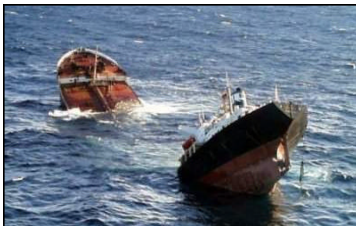
Figure 1: Prestige accident off the Spanish coast in November 2002

On the other hand, oil spills can be caused by accidents in shipping (see Figure 1) or offshore oil drilling. Improved safety regulations can lower the probability of these oil spills, but the risk of such accidents will remain.